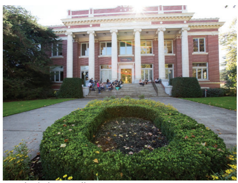
Outside of Johnson Hall, 2013.