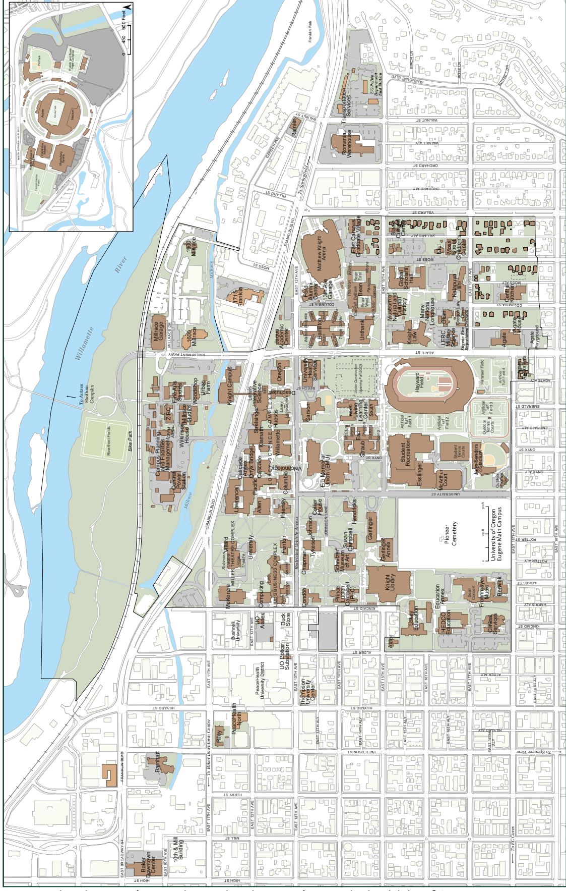
Map 2: University-owned Properties + University Leased Properties in Vicinity of Campus (Refer to Appendix I for a list of university-owned properties outside the campus boundaries, page 184.)