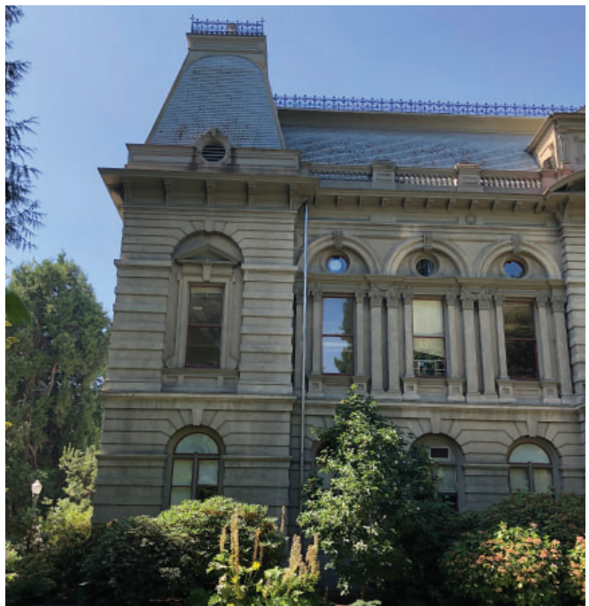
Villard Hall (National Landmark), 2021