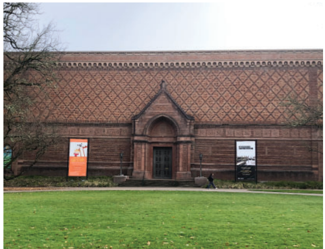
Jordan Schnitzer Museum of Art (National Register), 2025