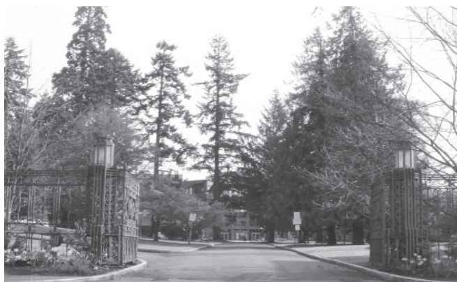
Dads' Gates (National Register)