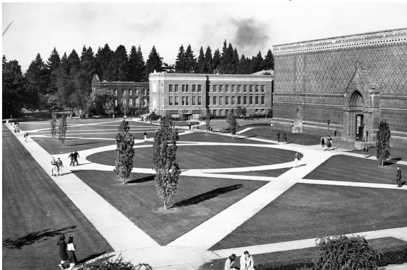
Memorial Quad, circa 1945