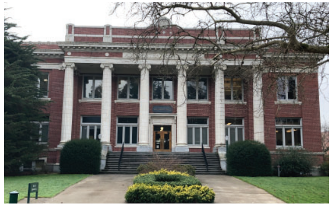
Johnson Hall (National Register), 2025