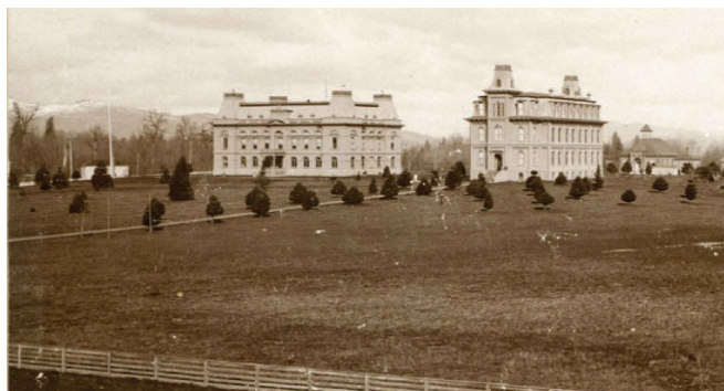
University Hall Walk Axis, circa 1896 (National Landmark)