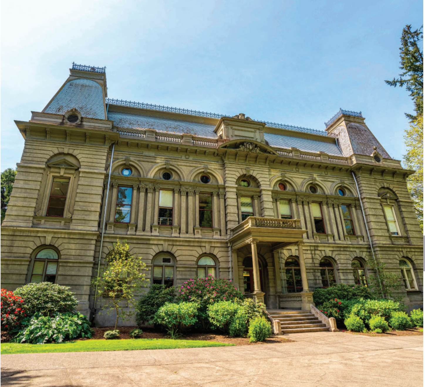
Villard Hall (constructed 1885-1886), 2021