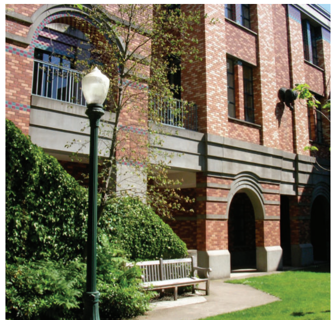
Streisinger Courtyard, 2007