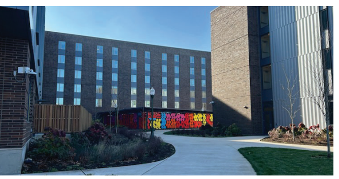
Yasui Residence Hall and Bike Storage, 2025