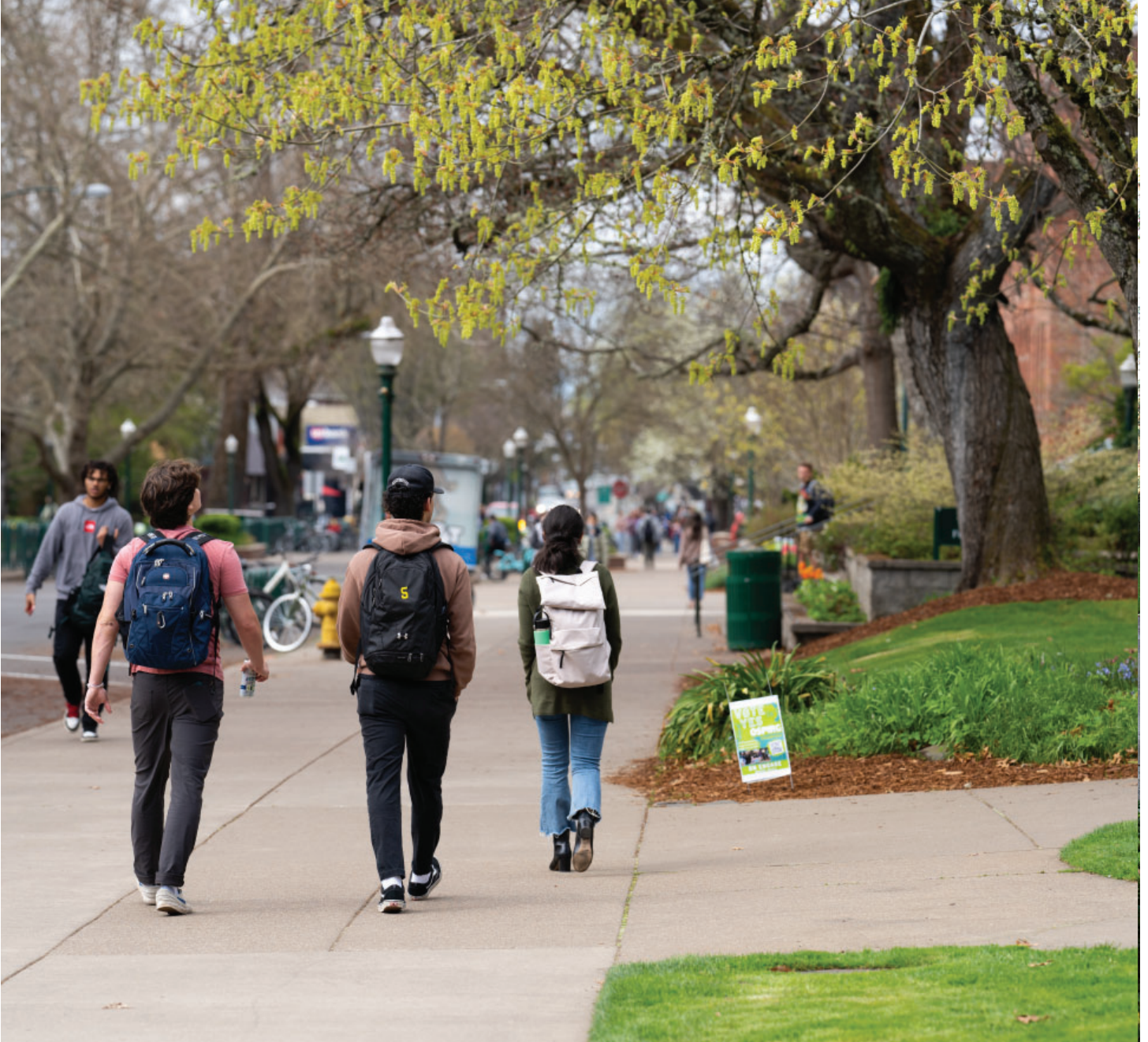
13th Avenue Axis, 2022