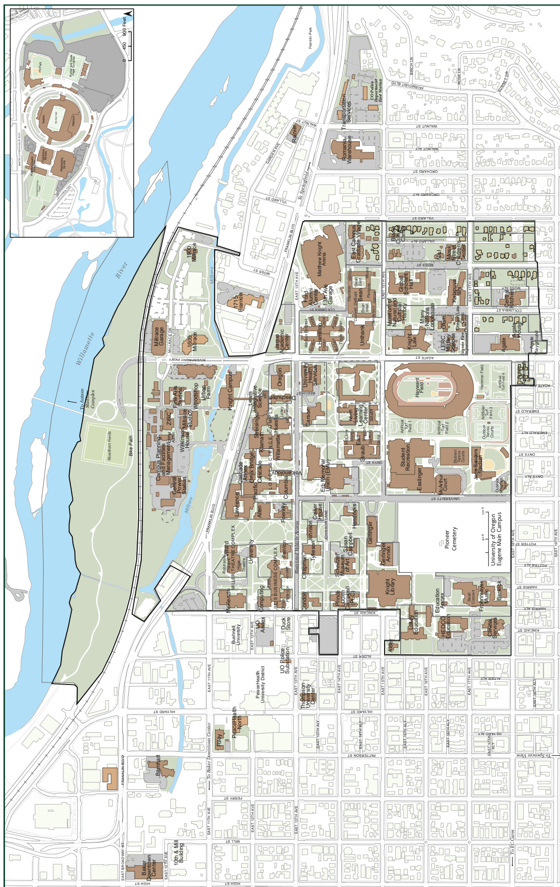
Map 2: University-owned Properties + University Leased Properties in Vicinity of Campus (Refer to Appendix I for a list of university-owned properties outside the campus boundaries, page 189.)