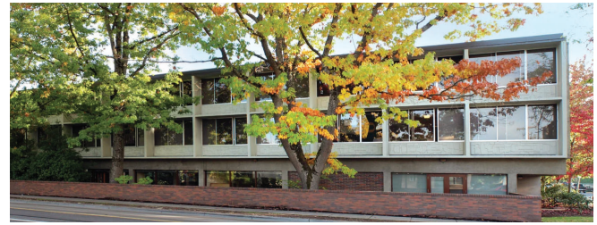
Riley Hall UO owned property outside campus boundary, date unknown

Refer to "Principle 1: Process and Participation" (page 21) for how this determination will be made. See Map 2 on the following page. Also, see Appendix I for a list of university-owned properties outside of the Approved Campus Boundaries.