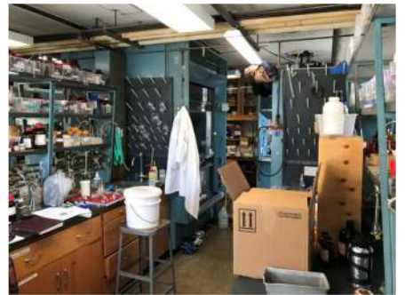
Existing Lab Conditions

Project Type: Building Renovation and Systems Replacement