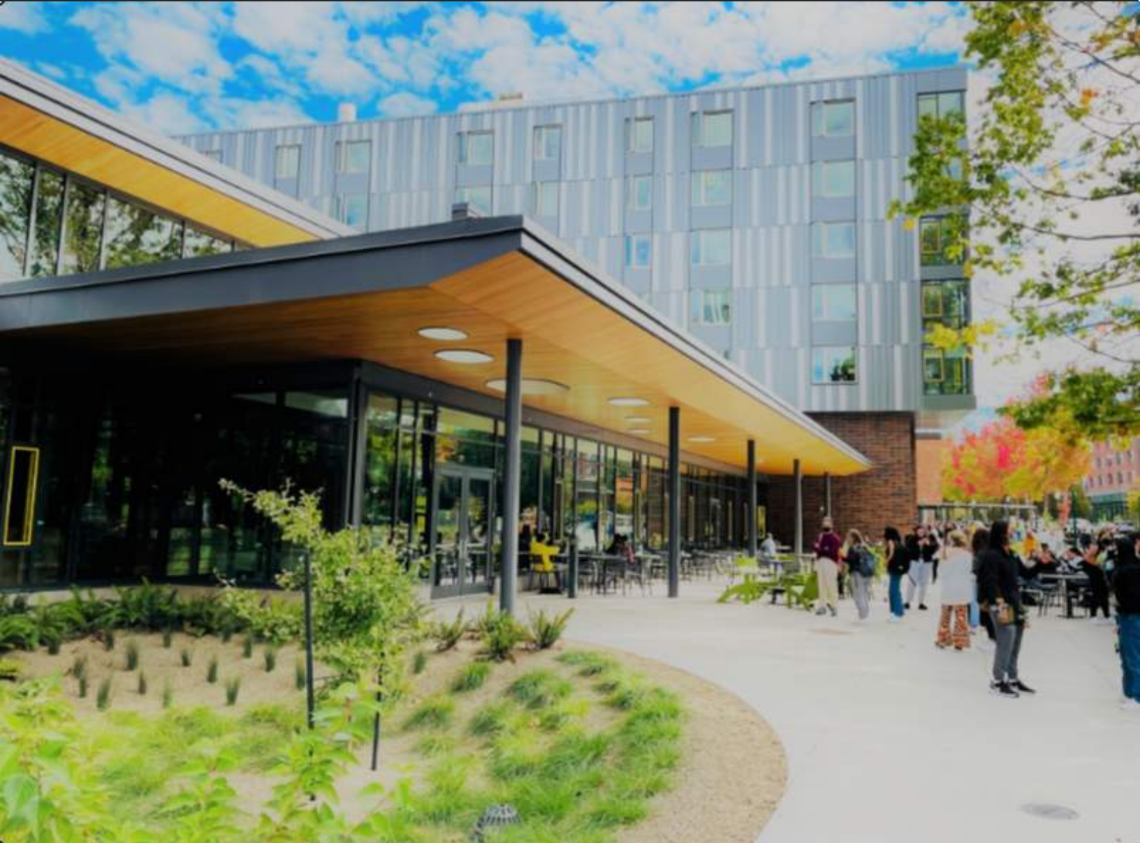
DeNorval Unthank Jr. Hall