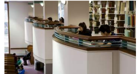
Study space in 1994 Addition

Project Type: New Storage Structure and Existing Building Renovation