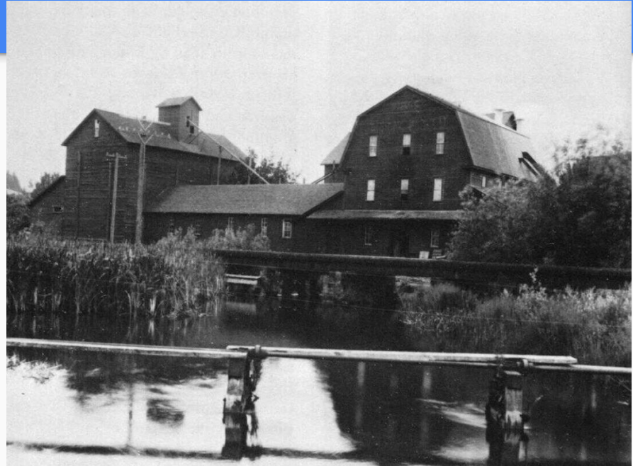
Eugene Mill Company. [Circa 1880], Illustrated History of Lane County, Oregon.