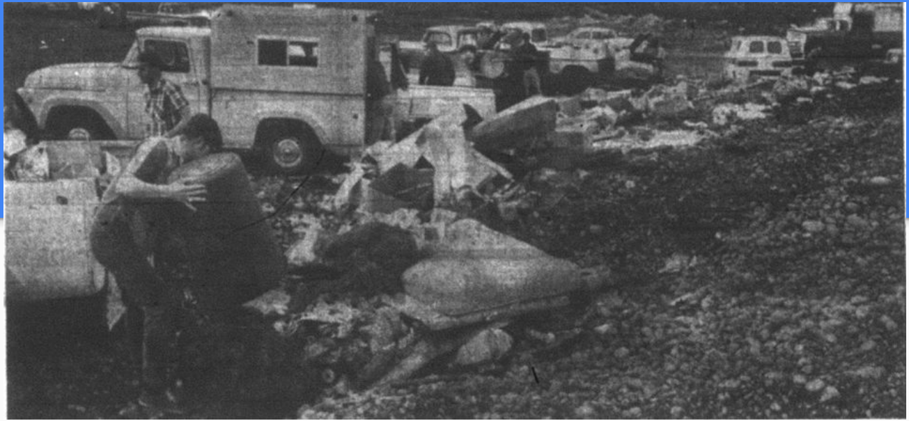
Left: Register Guard , 1970 (Amazon Creek)