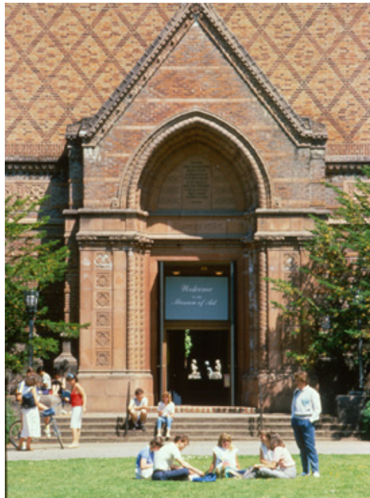
Jordan Schnitzer Museum of Art