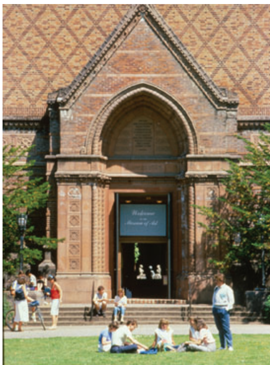
Jordan Schnitzer Museum of Art