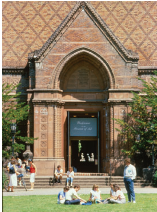
Jordan Schnitzer Museum of Art