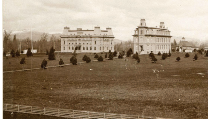
University Hall Walk Axis, circa 1896 (National Landmark)