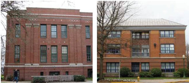
Composition - Buildings should be vertically composed of three parts: top, middle, and bottom. Provide distinction through the use of horizontal lines, such as banding, use of different materials, or variation in patterns and textures.