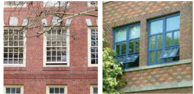
Operable Windows and Window Details - Allow fresh air and the ability to adjust personal environment. Window details can include change in material with banding, brick patterns, type and color of frame.