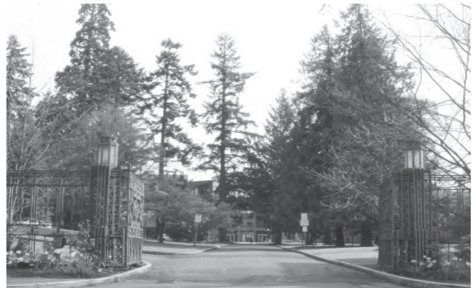
Dads' Gates (National Register)