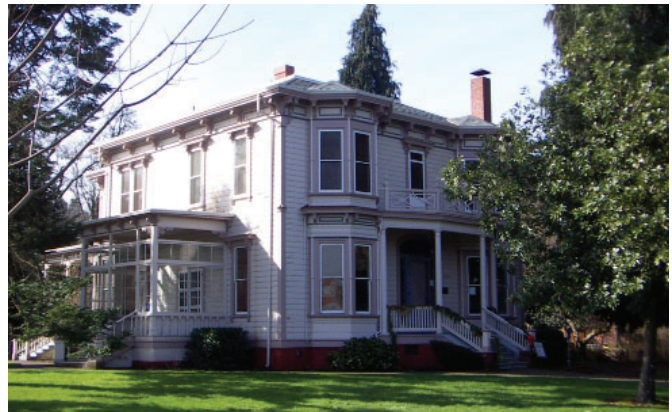
Collier House (City Landmark)