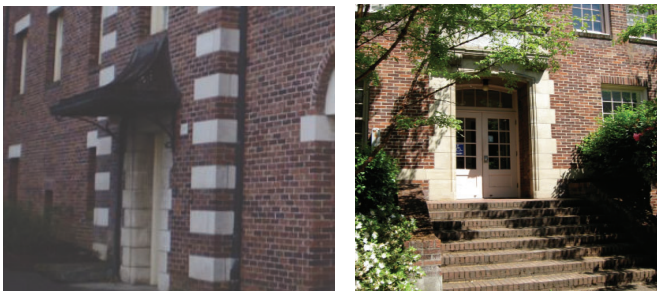
Secondary Entrances - These are not as bold as a main entrance, but still easy to locate and with visual interest.