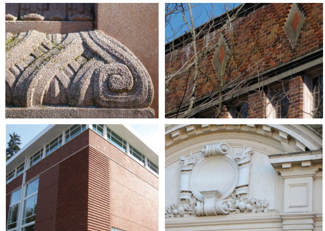
Details - Contribute to the richness of the campus character by giving each building a sense of individuality. Humanize buildings and integrate art.