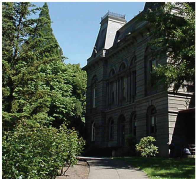
Villard Hall (National Landmark)