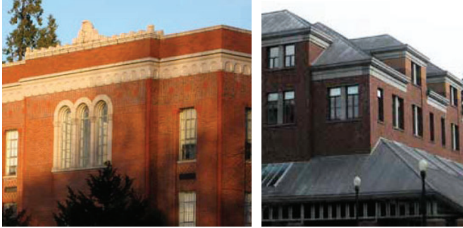
Building Meets the Sky - Complex rooflines draw your eye upwards.