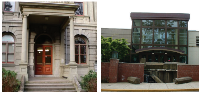
Main Building Entrance - Provide a clear sense of where to go, how to enter the building; a feeling of arrival, building presence, and weather protection.