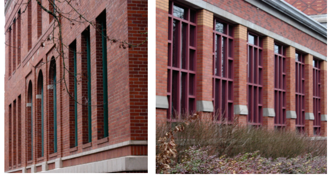
Rhythm of Windows - Repetition of windows break up the scale of the facade (e.g., openings separated by columns or other vertical elements or recessed windows). As a general (but not absolute) rule, avoid large, blank facades, large areas of glazing, or unbroken, horizontally oriented windows (ribbon windows).