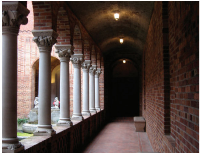
Jordan Schnitzer Museum of Art (National Register)