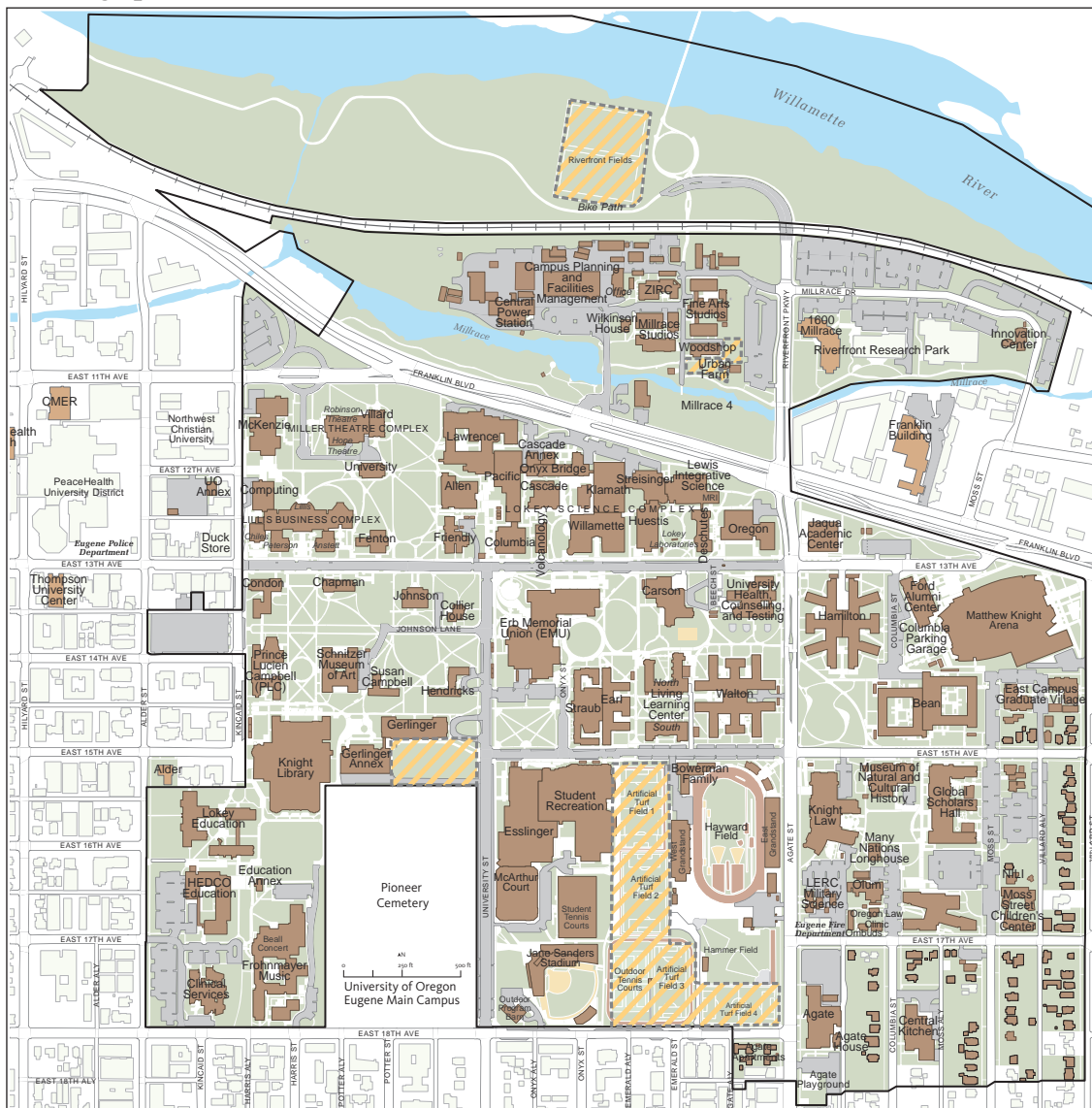
Diagram of Outdoor Classrooms (used for curricular offerings)