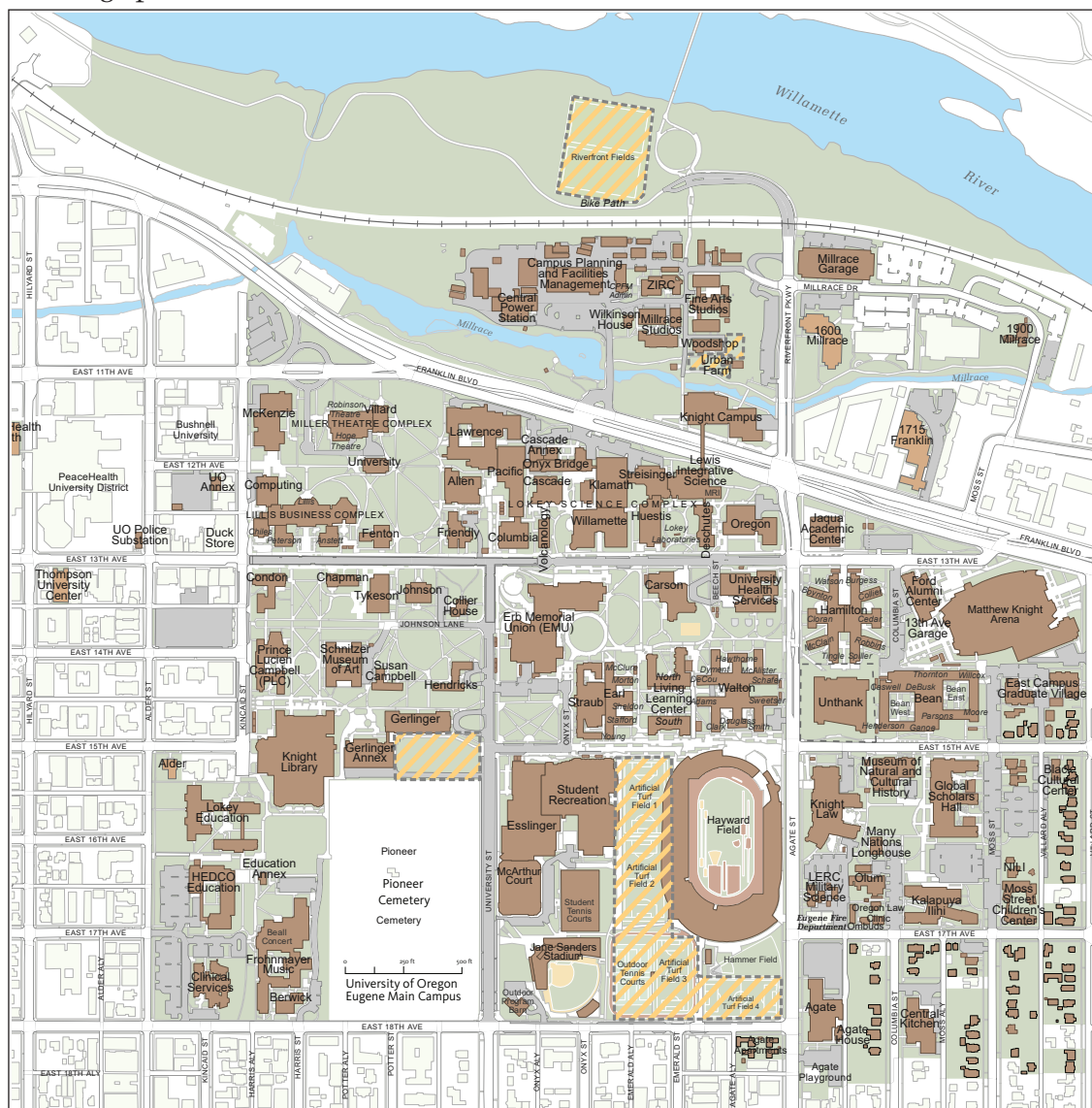
Diagram of Outdoor Classrooms (used for curricular offerings)

Many campus open spaces serve as vital classrooms (see diagram below). These functions require open, sunny spaces (for example, sports fields, marching-band practice areas, the Urban Farm, and informal, outdoor meeting spaces).