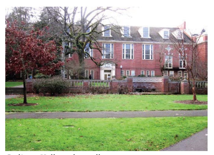
Gerlinger Hall, garden wall, 2013.

The concepts of spatial organization contained in these early plans were reflective of Lawrence's Beaux-Arts training and are still evident on this campus seventy-five years later. The principles expressed in this current document preserve and expand the network of interconnected quadrangles, squares, malls, and promenades, which were characteristic of Lawrence's early development pattern.