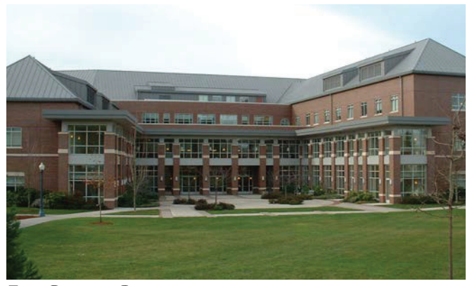
East Campus Green, 2005.

The 1991 Long Range Campus Development Plan represented a continuation of these planning traditions. A large body of norms, traditions, and development principles had developed over the course of the institution's history, but had remained unwritten or at best recorded only in repetitive actions of individuals and groups engaged in campus development activities.