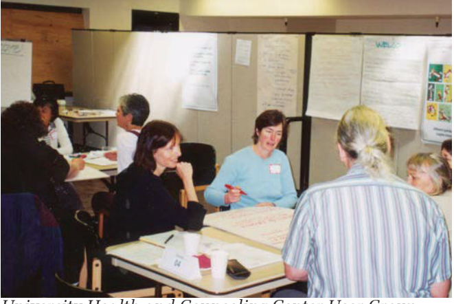
University Health and Counseling Center User Group,