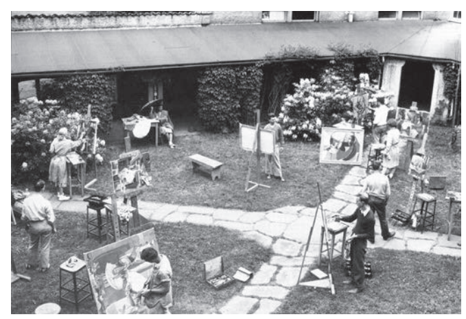
Lawrence Courtyard, c.1940.

The University of Oregon's campus will be responsive to the needs of its occupants, adaptable to emerging opportunities, and beautiful to behold.