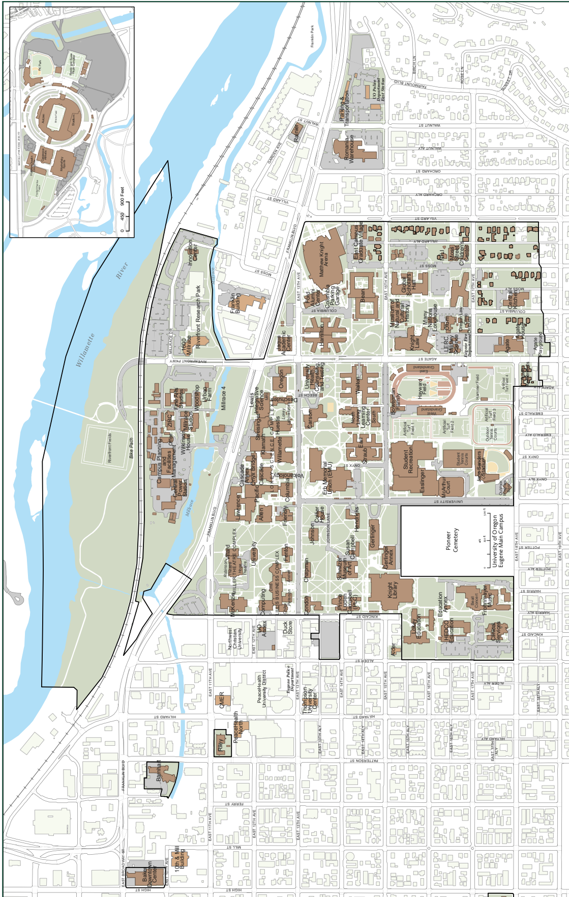
Map 2: University-owned Properties + University Leased Properties in Vicinity of Campus (Refer to Appendix I for a list of university-owned properties outside the campus boundaries, page 137.)