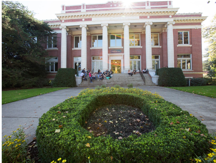
Outside of Johnson Hall, 2013.