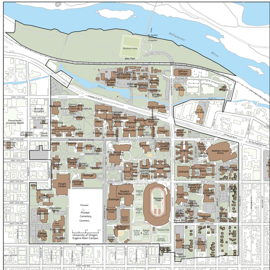
Map 1: University of Oregon Campus Boundaries

Properties that are fully leased and occupied by the University (e.g. properties leased from the UO Foundation) are subject to Campus Plan requirements to the degree applicable and in a manner similar to University-owned properties outside of the Campus Boundaries.