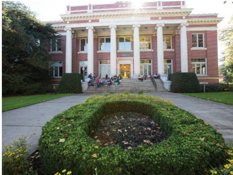
Outside of Johnson Hall, 2013.