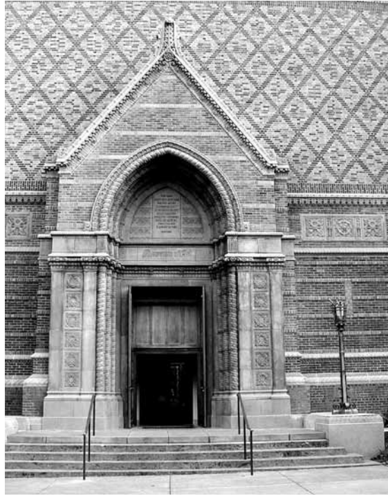
Jordan Schnitzer Museum of Art, 2005.