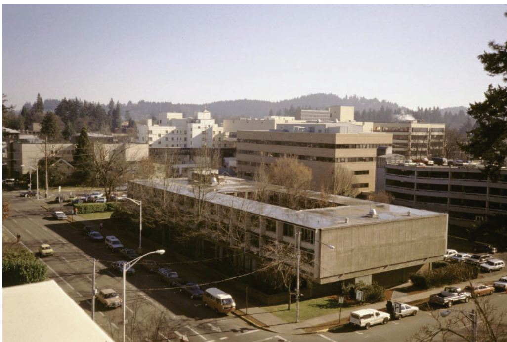
Figure 1. Riley Hall, c1960, northwest aerial view