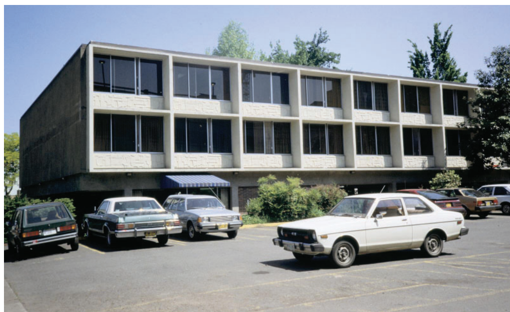
Figure 2. Riley Hall, c1989, south elevation