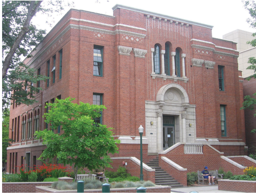
(See Continuation Sheet 1 for additional photos of this building)