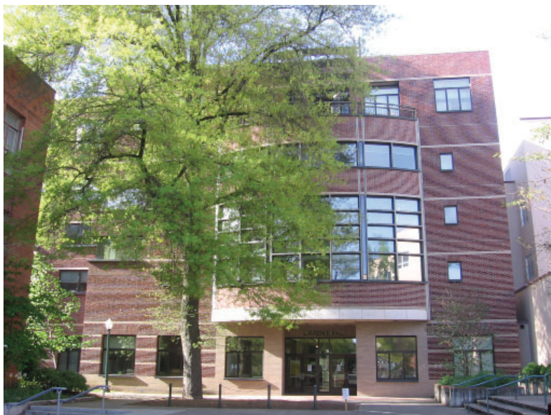
Figure 2. Lawrence Hall, south facade