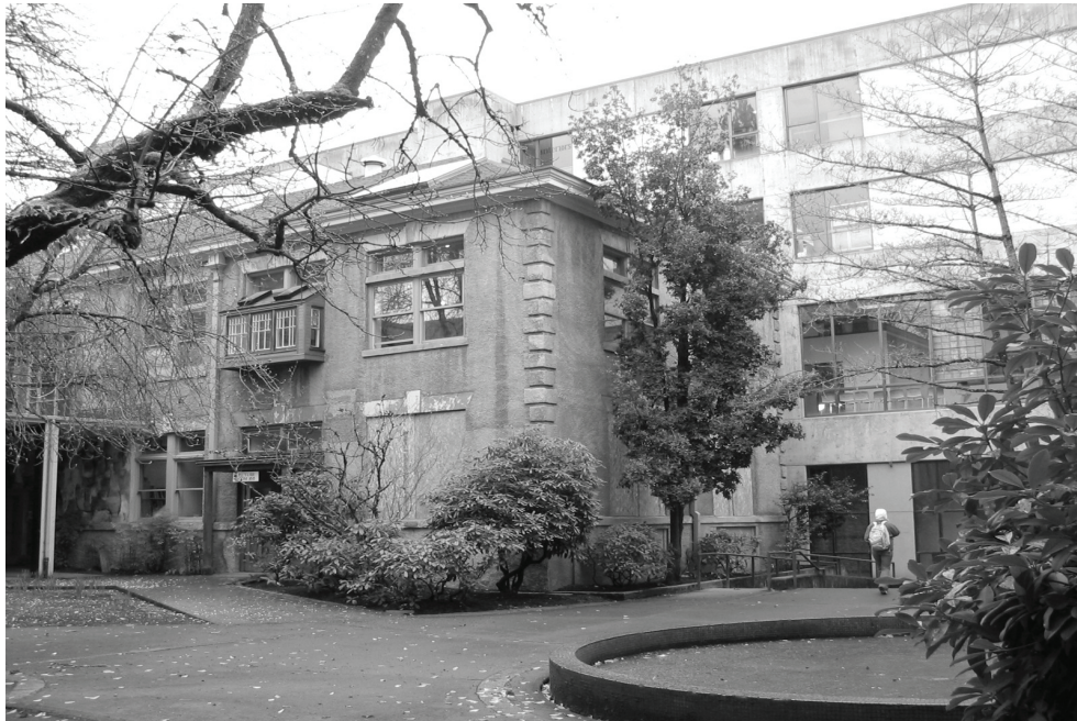
(See Continuation Sheet 3 for additional photos) 1971 addition visible behind 1914 Architecture Building