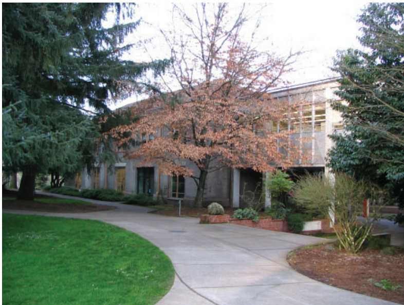
Figure 1. Lawrence Hall, west facade (Mechanical Hall)