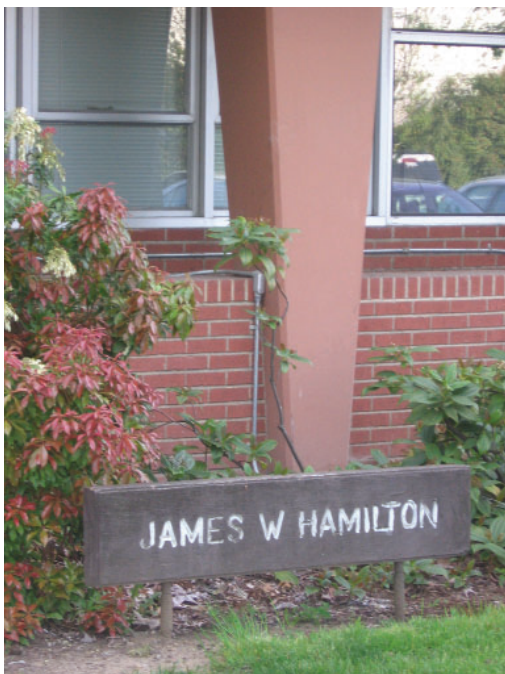
Figure 3. Hamilton Hall's wooden marker