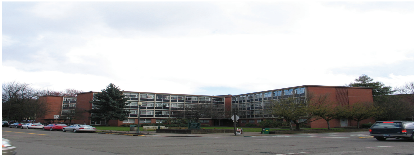
Hamilton Hall Complex, taken from northwest corner (corner of 13th and Agate Streets) (See Continuation Sheet 1 for additional photos of this building)