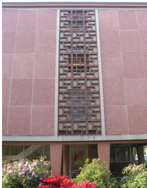
Figure 2. Hamilton Hall. Dunn's endwall.