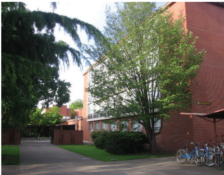
Figure 1. Hamilton Hall. Semi-enclosed courtyard.