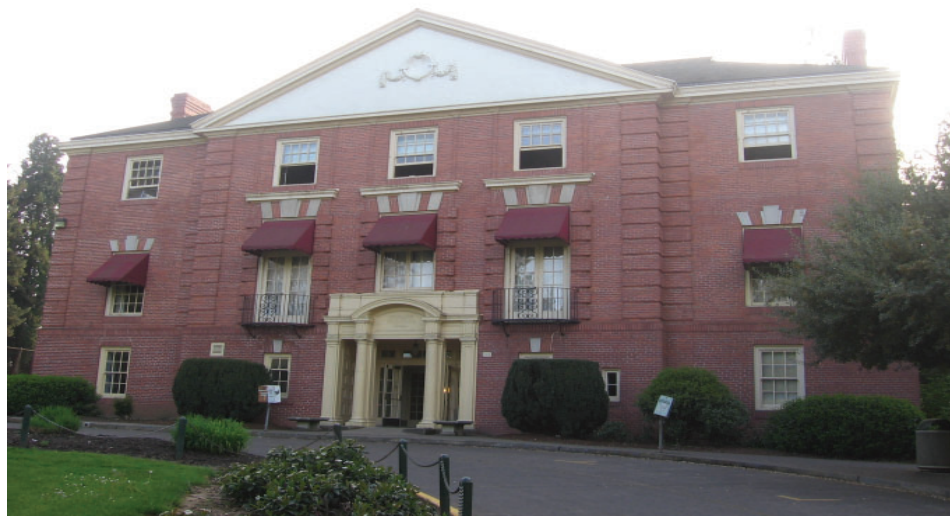
Figure 2. Gerlinger Hall, east elevation