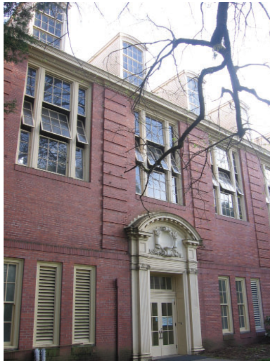
Figure 1. Gerlinger Hall, north elevation