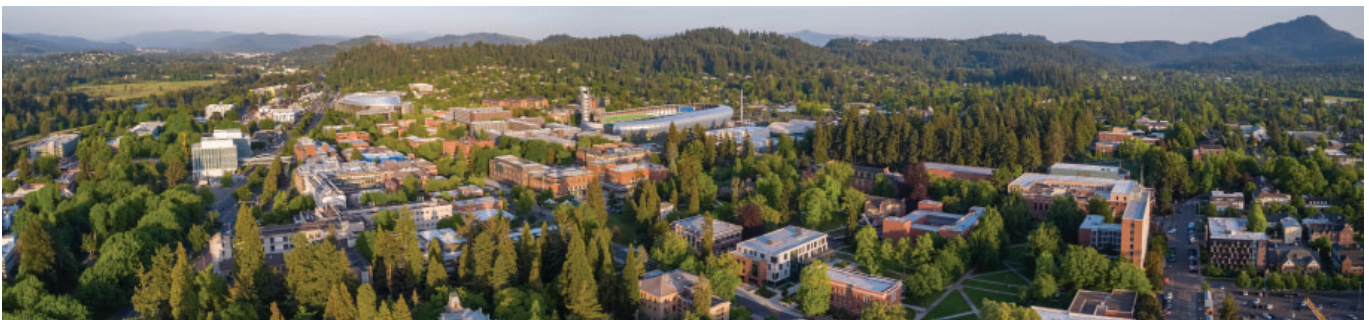
Campus Aerial, 2023

To control the look and feel of the campus, no construction project shall result in a density in excess of the maximum densities established in “Principle 3: Densities” (page 49).