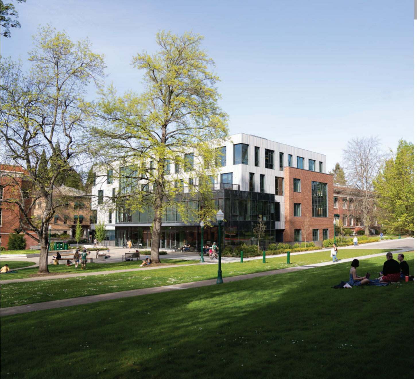
Tykson - Chapman Hall Open Space, 2023