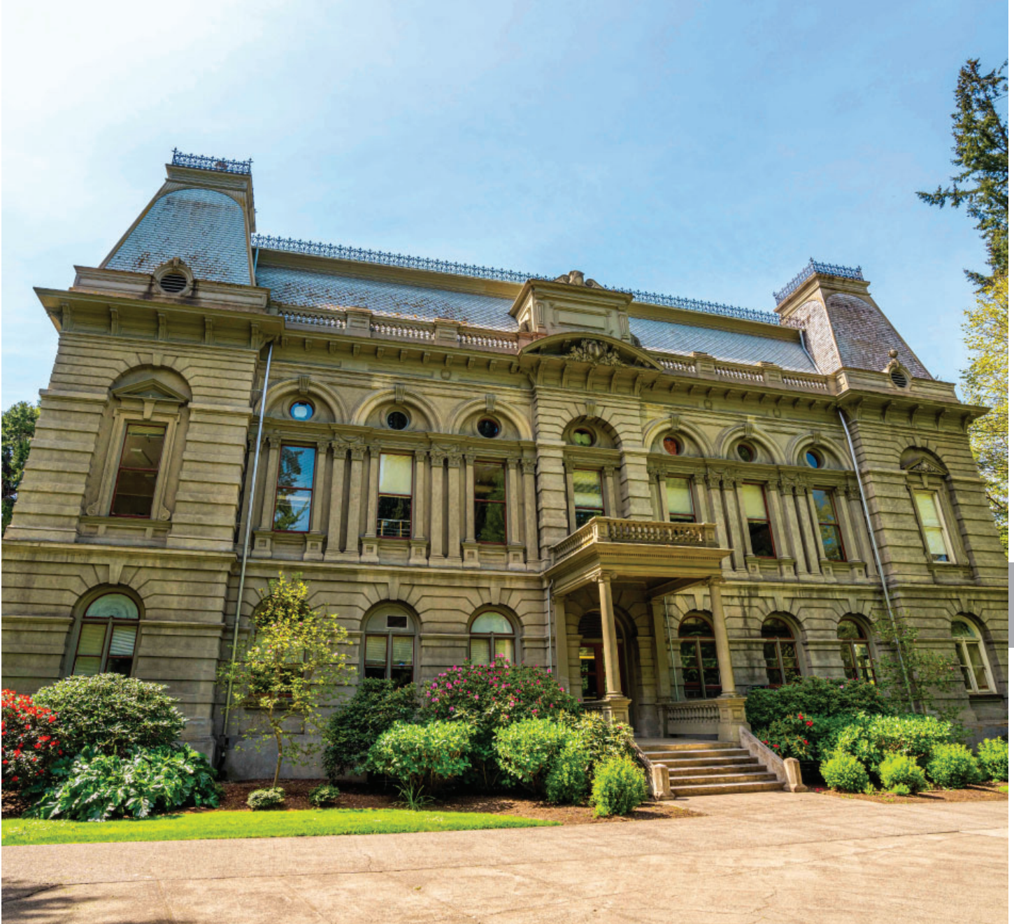
Villard Hall (constructed 1885-1886), 2021