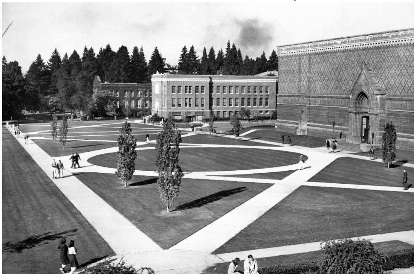
Memorial Quad, circa 1945 (National Register)