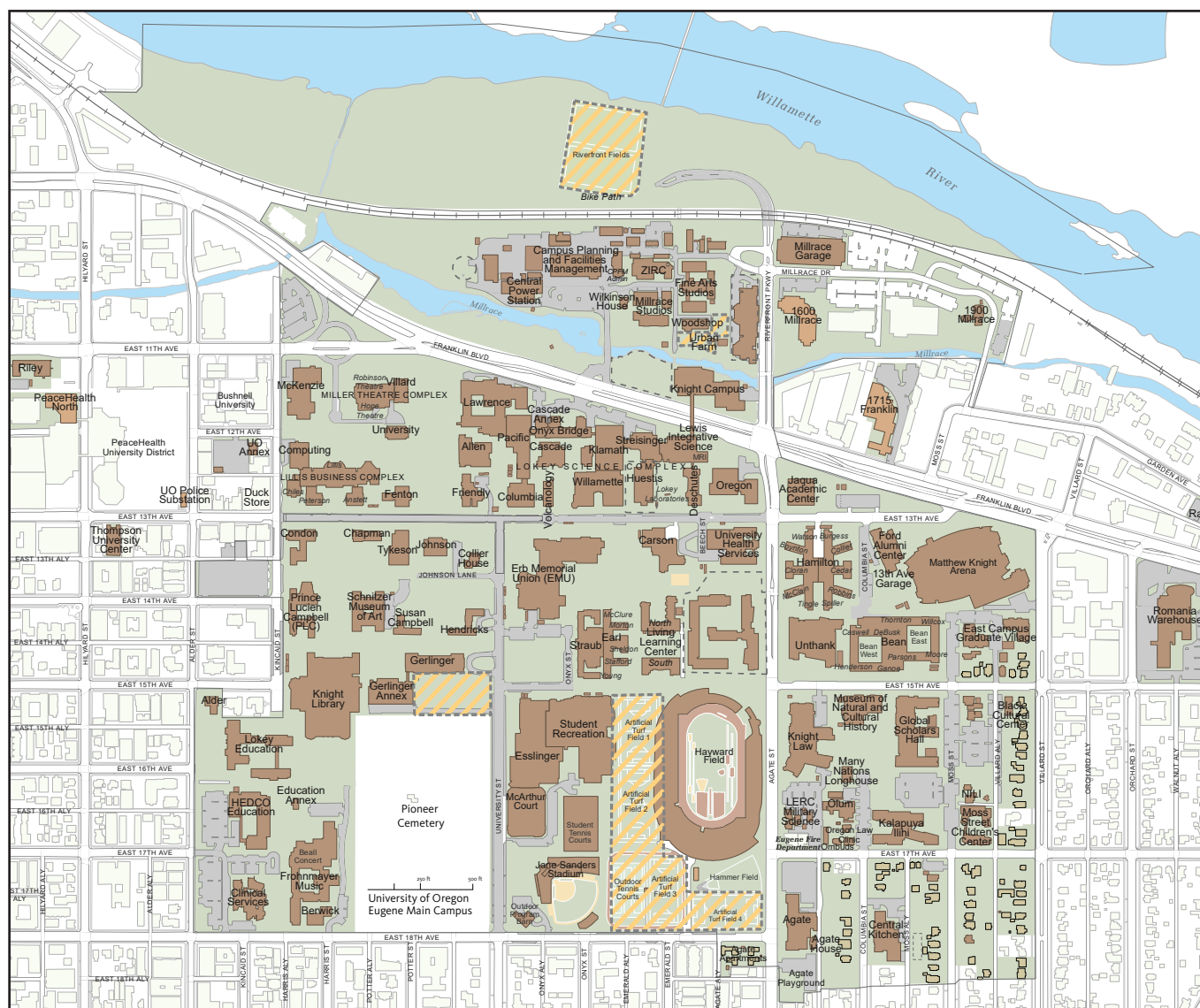
Diagram of Outdoor Classrooms (used for curricular offerings)