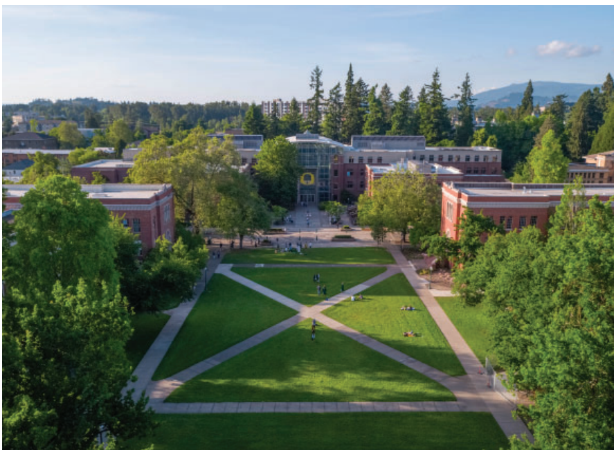
Memorial Quad, 2019