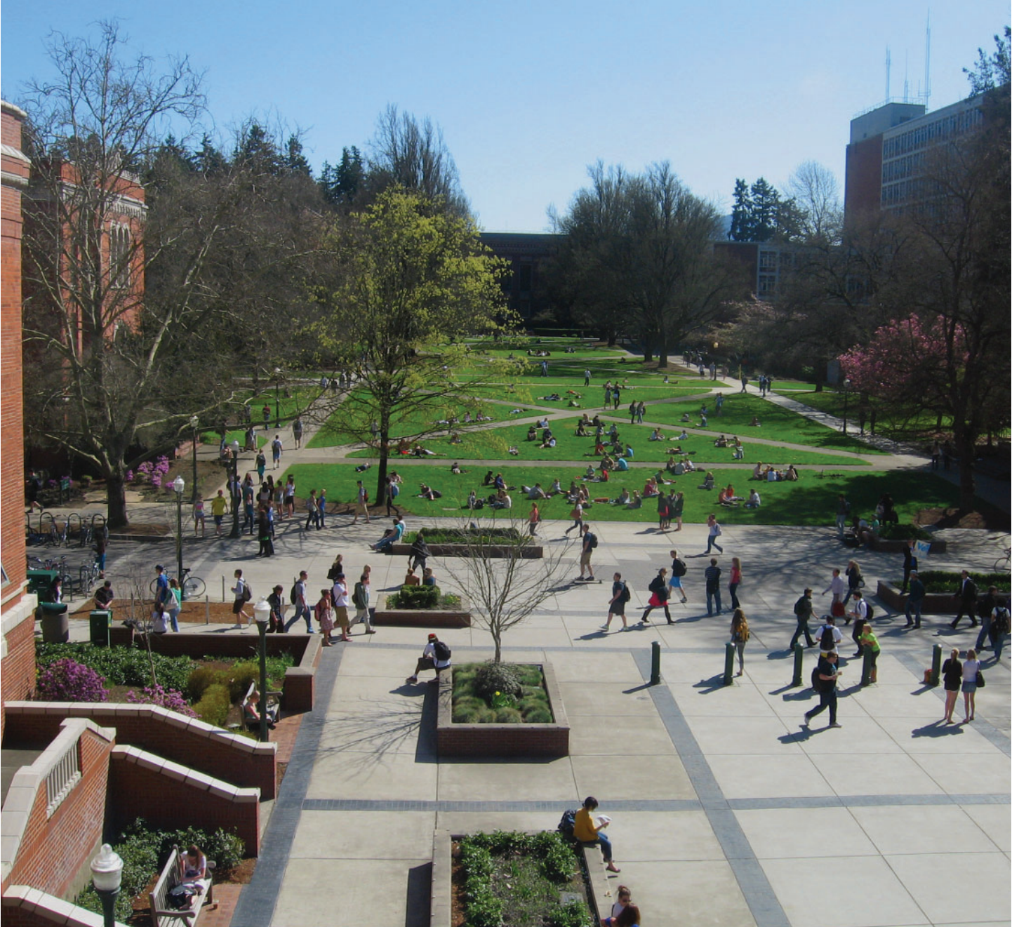
13th Avenue Axis and the Memorial Quadrangle as viewed from Lillis, 2009