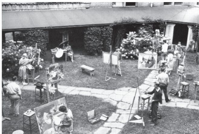
Lawrence Courtyard, c.1940

The University of Oregon's campus will be responsive to the needs of its occupants, adaptable to emerging opportunities, and beautiful to behold.