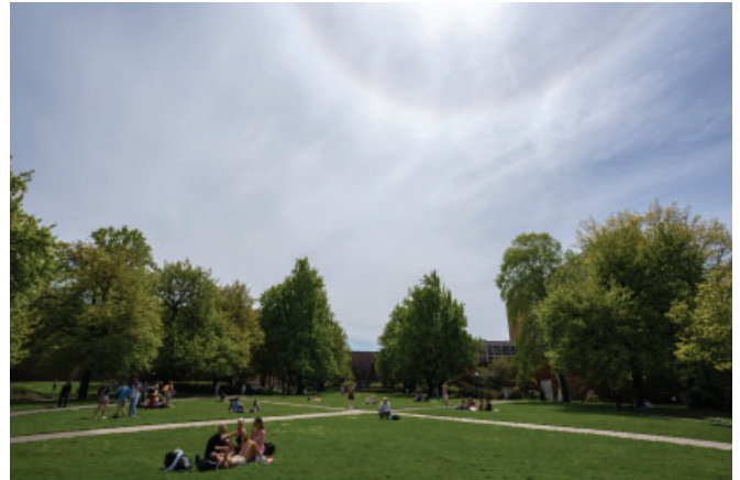
Memorial Quad, 2022

The university recognizes the need to respond quickly to emerging opportunities for facilities improvements, but also emphasizes long-range planning and the importance of maintaining continuity in development decisions over time. The Plan is based on a ten-year outlook, but its vision, patterns, and principles are useful for longer-term projections.