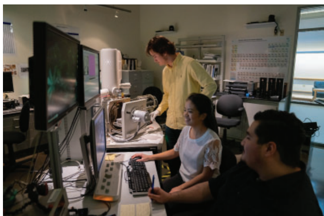
Knight Campus, 2019