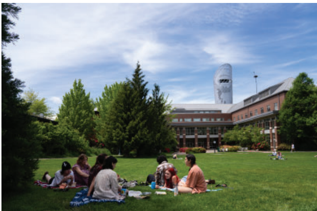
East Campus Green, 2024

The 1991 Long Range Campus Development Plan represented a continuation of these planning traditions. A large body of norms, traditions, and development principles had developed over the course of the institution’s history, but had remained unwritten or at best recorded only in repetitive actions of individuals and groups engaged in campus development activities.