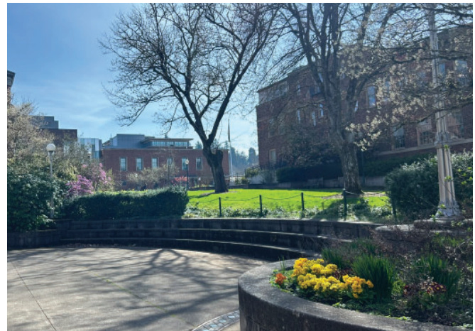
Onyx Green, 2025