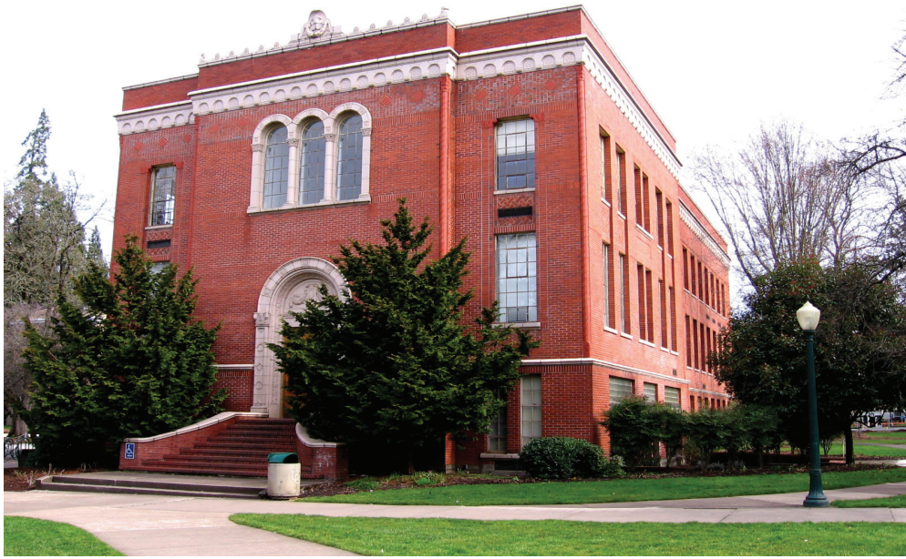
(See Continuation Sheet 1 for additional photos)