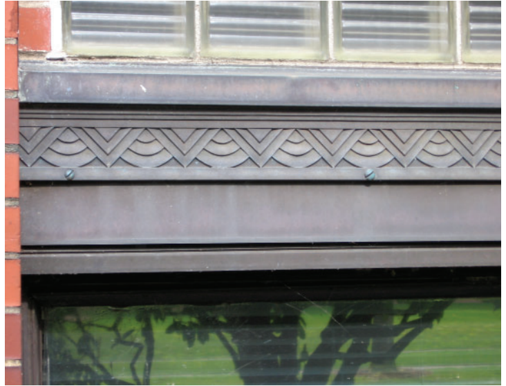
Figure 1. and 3. Chapman Hall, decorative details.