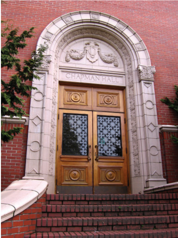
Figure 2. Chapman Hall, main entry detail.