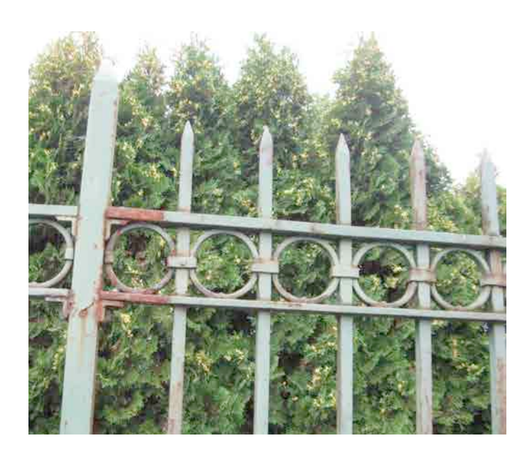
Figure 6. Fence, detail