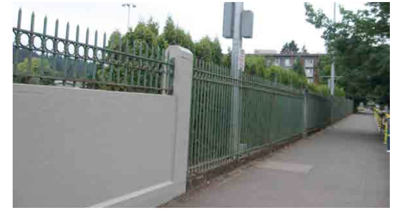
Main Howe Gates and concrete wall, Looking East