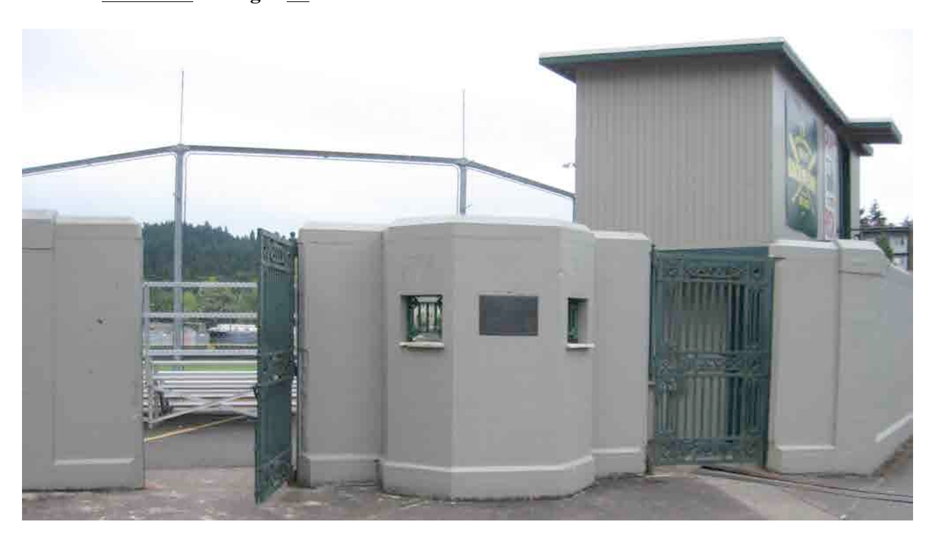
Figure 2. Concrete Wall, Ticket Booth, and Secondary Gates