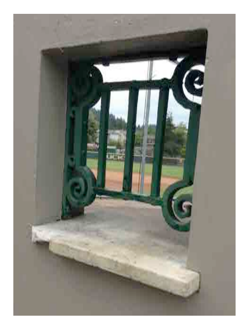
Figure 3. Ticket Window with Marble surface and Iron Grill