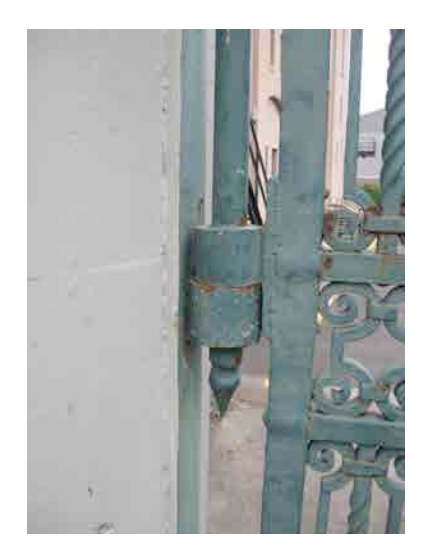
Figure 5. Gates, detail