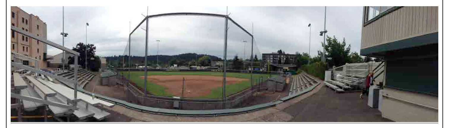
Ball Field, Backstop, Seating, Looking Southeast