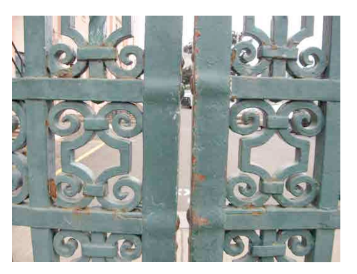
Figure 4. Gates, detail