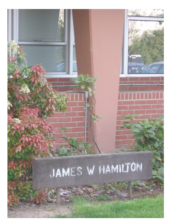
Figure 3. Hamilton Hall's wooden marker