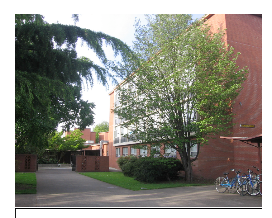
Figure 1. Hamilton Hall. Semi-enclosed courtyard.