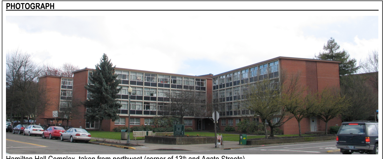
Hamilton Hall Complex, taken from northwest (corner of 13<sup>th</sup> and Agate Streets) (See Continuation Sheet 1 for additional photos of this building)