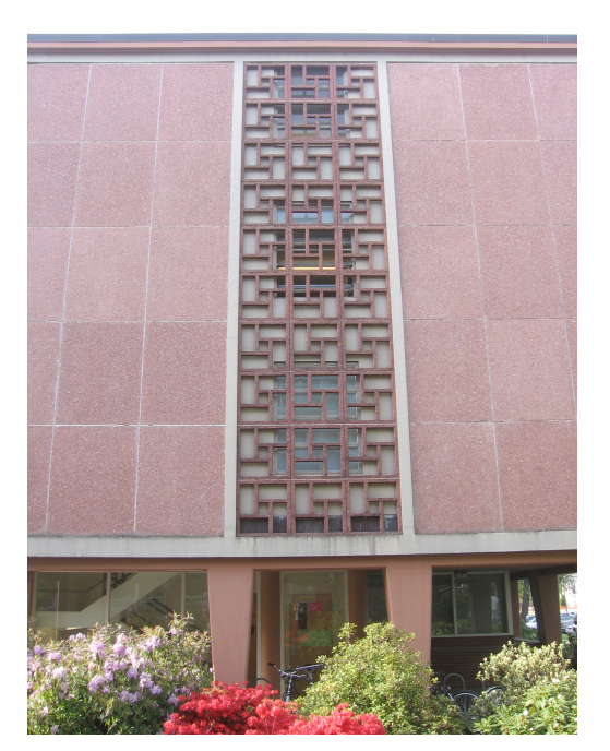
Figure 2. Hamilton Hall. Dunn's endwall.