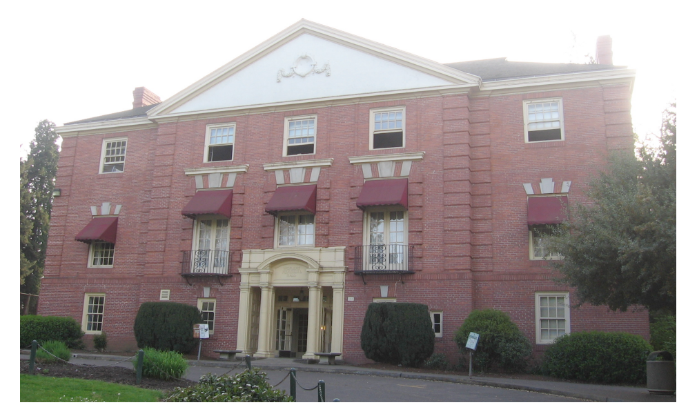
Figure 2. Gerlinger Hall, east elevation