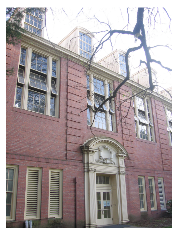
Figure 1. Gerlinger Hall, north elevation detail.