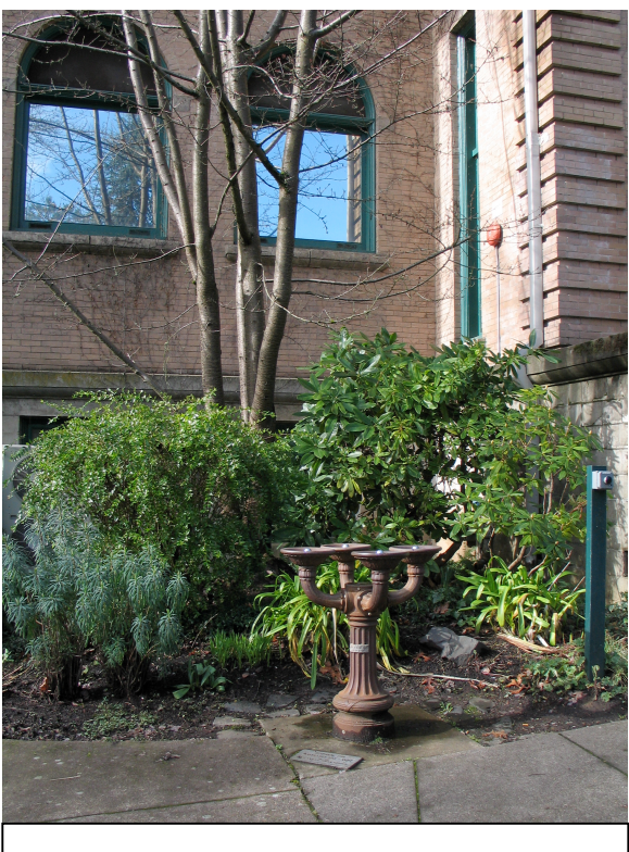
Figure 2. Fenton Hall, drinking bubbler