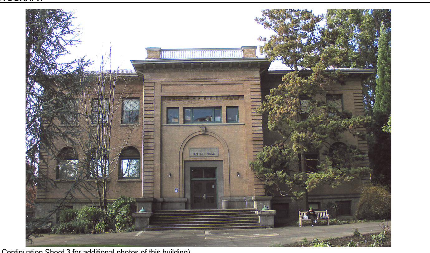
(See Continuation Sheet 3 for additional photos of this building)