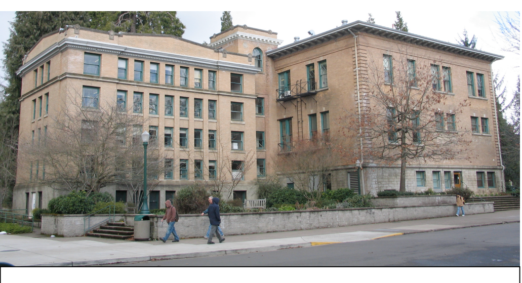
Figure 1. Fenton Hall, south elevation