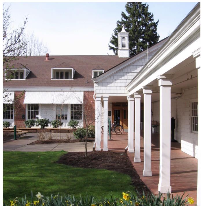
Figure 2. Education Complex courtyard