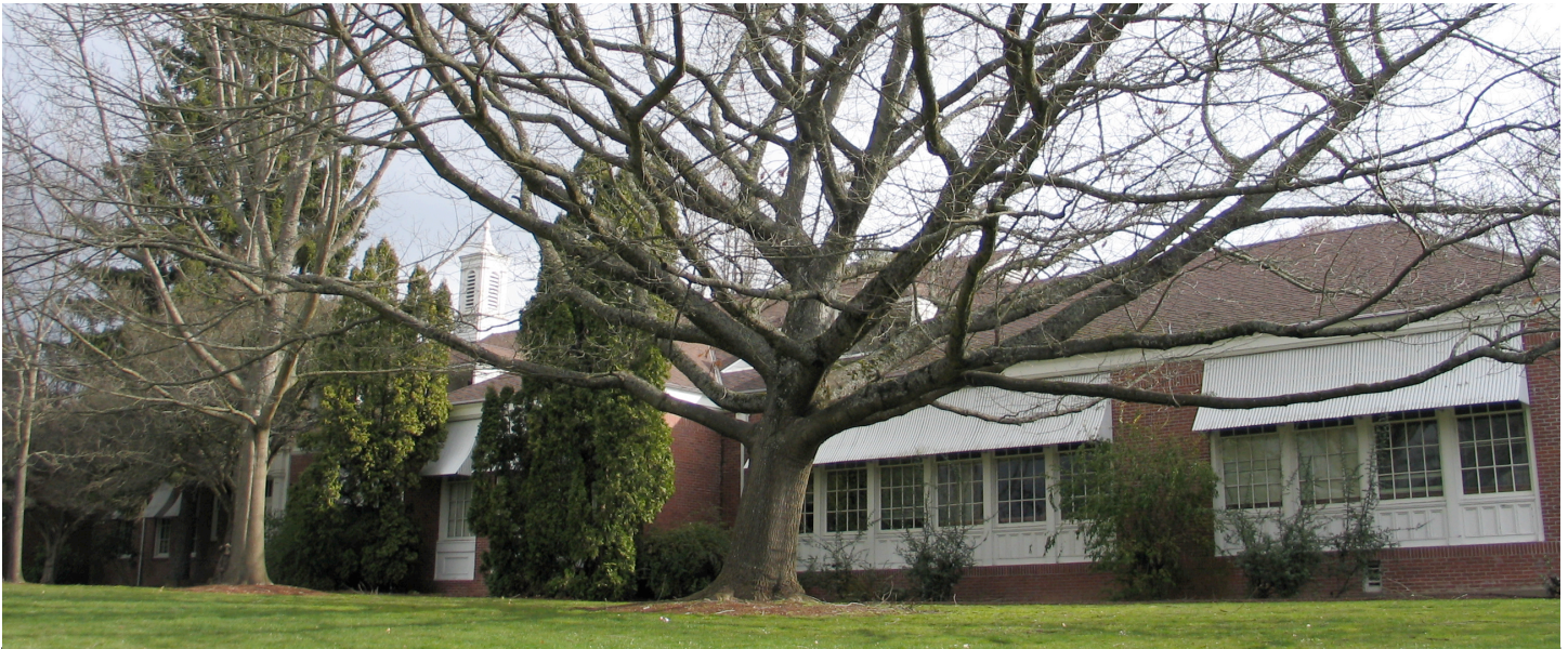
Figure 1. Education West building with cupola evident