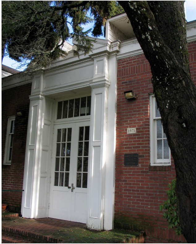
(See Continuation Sheet 1 for additional photos)