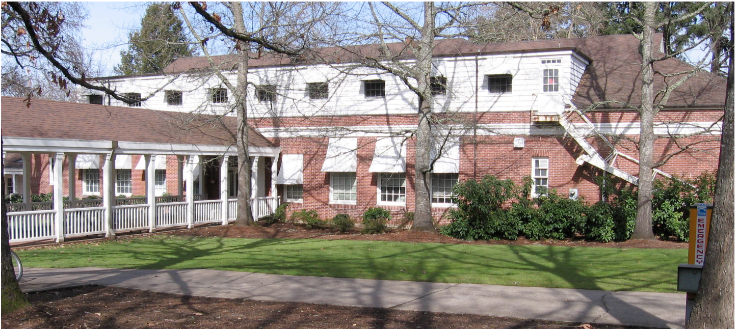
Figure 1. Education Complex. south covered walk