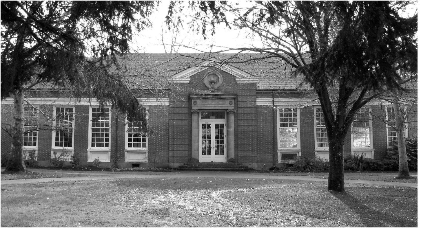
(See Continuation Sheet 1 for additional photos)