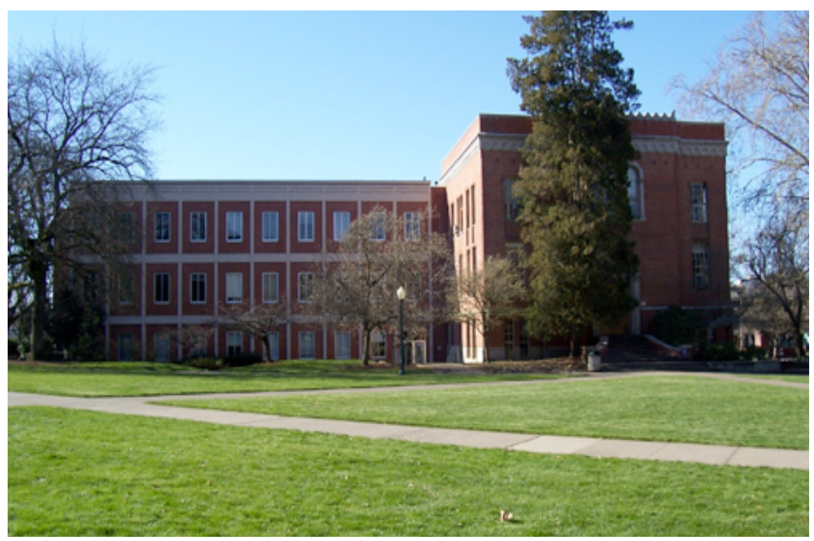
(see Continuation Sheet 1 for additional photos of this building)