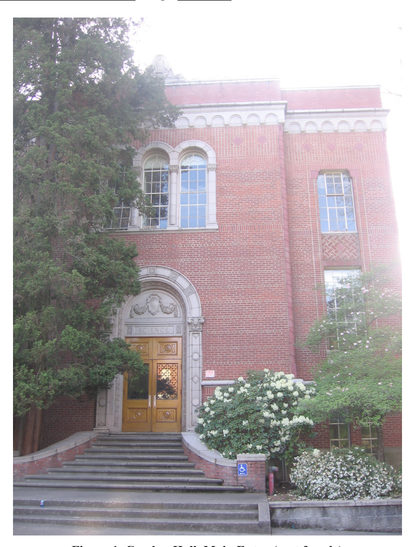
Figure 1. Condon Hall, Main Entry (east facade)