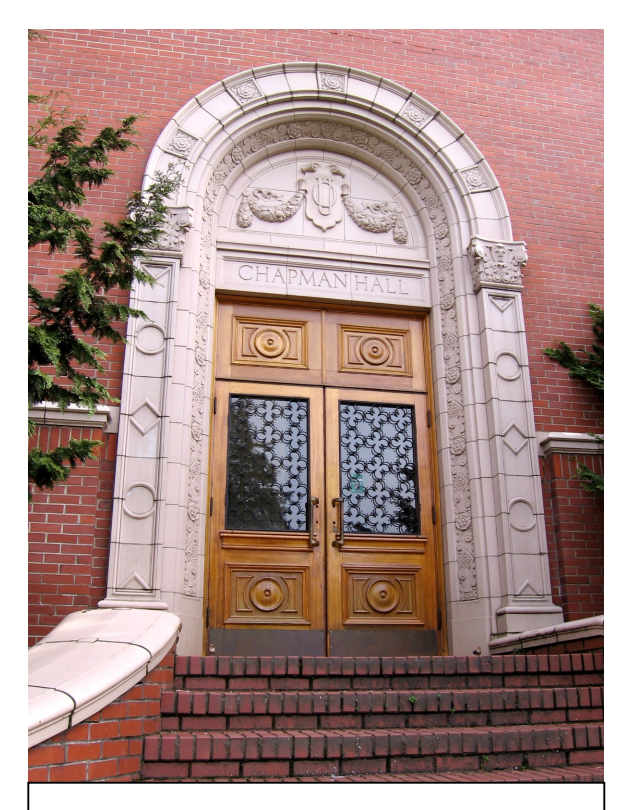
Figure 2. Chapman Hall, main entry detail.