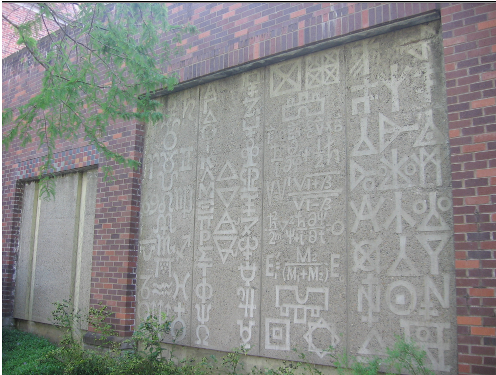
Figure 1. East side of Volcanology bunker, art panel.