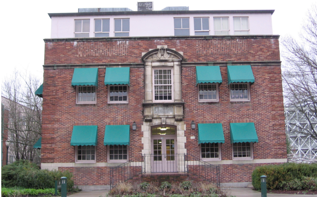
(See Continuation Sheet 1 for additional photos of this building)