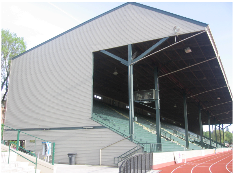
Figure 3. East Grandstand, facing south