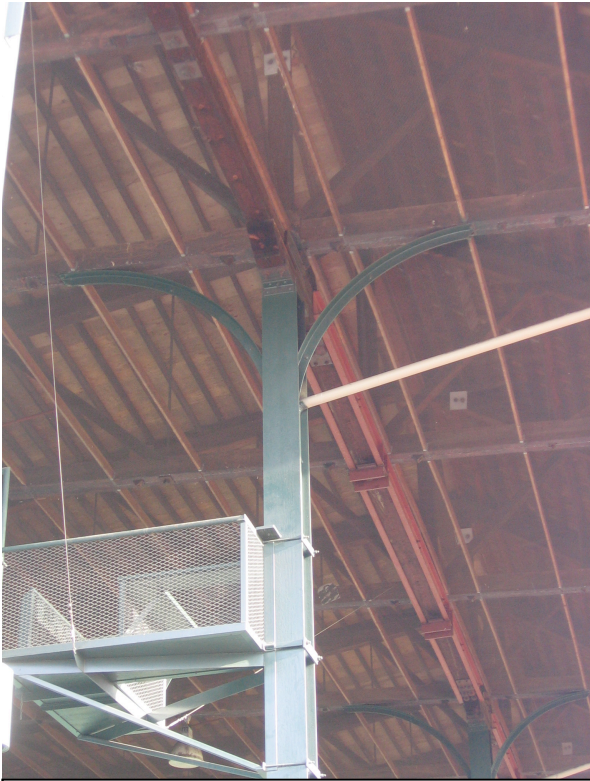
Figure 1. East Grandstand, interior detail (ceiling)