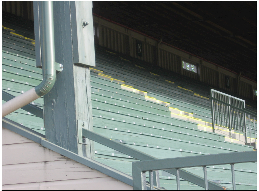
Figure 2. East Grandstand, interior detail (seating)