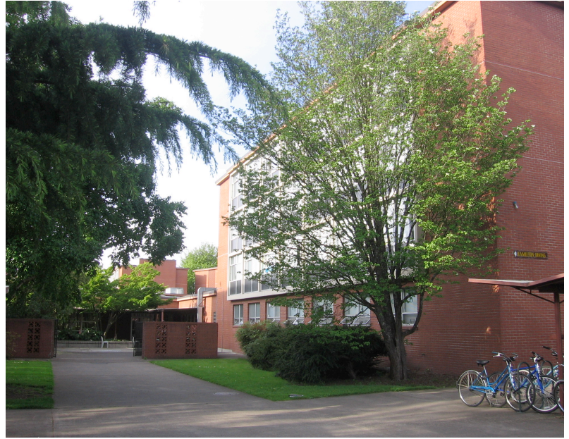
Figure 1. Hamilton Hall. Semi-enclosed courtyard.