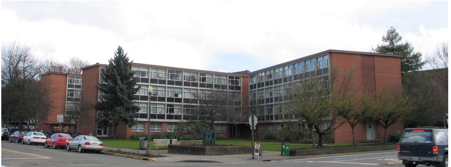
Hamilton Hall Complex, taken from northwest (corner of 13 th and Agate Streets) (See Continuation Sheet 1 for additional photos of this building)