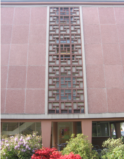
Figure 2. Hamilton Hall. Dunn's endwall.